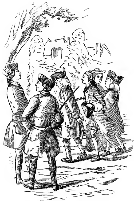
The Dictionary Maker.